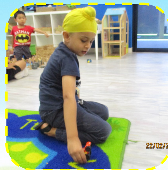
Here's some extra photos from our day